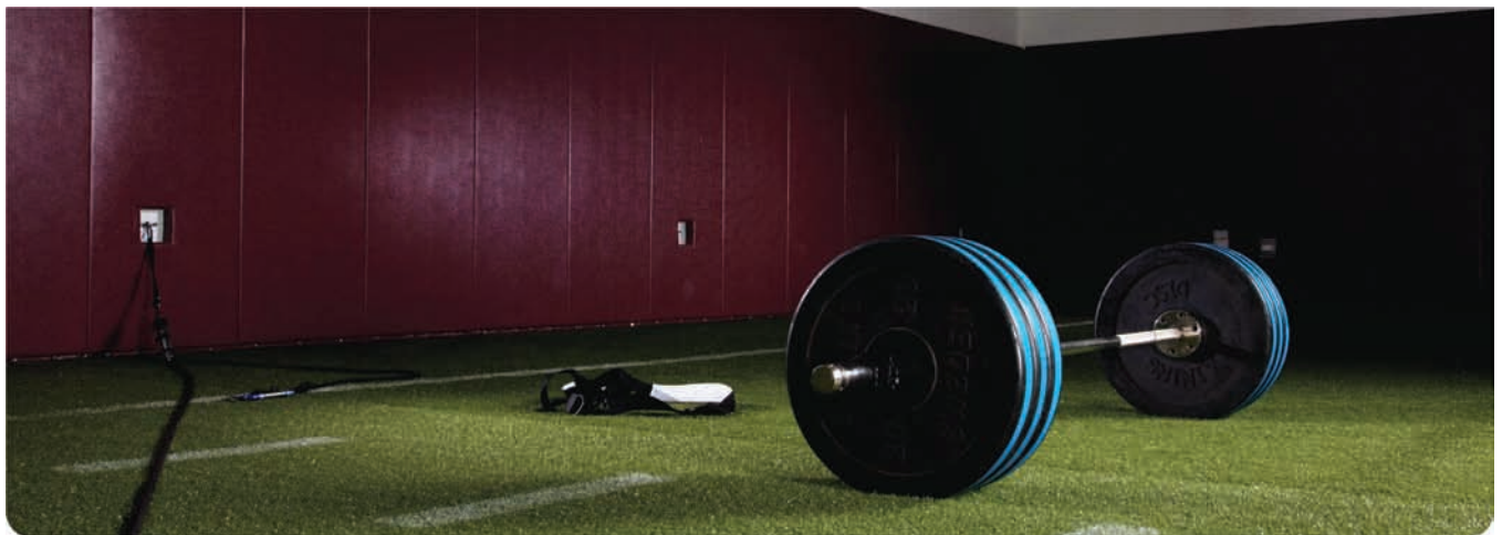
33-yard AstroTurf® PureGrass® Acceleration & Agility Area