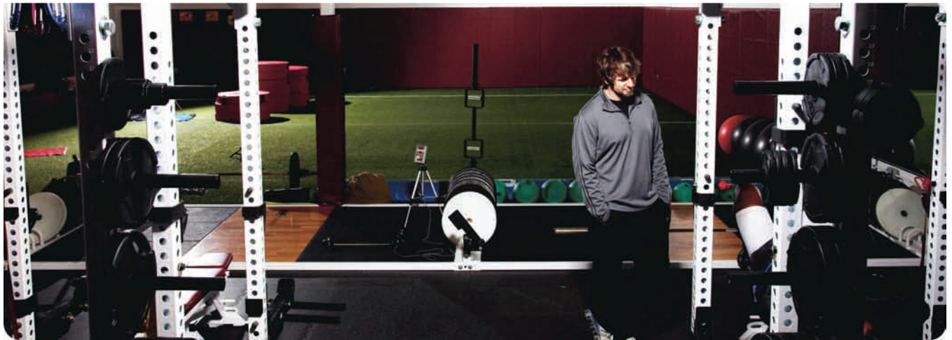
Sorinex™-Equipped Weight Room